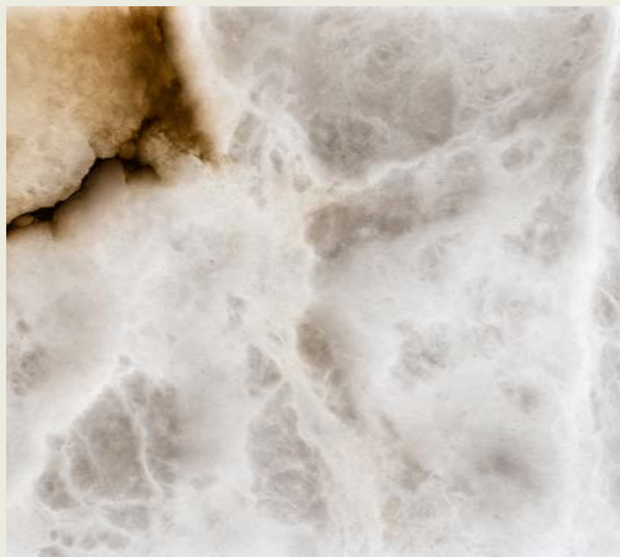
ZAIDA Selected for its exceptional snow-white translucency, reddish earth-toned veining and subtle cloud-like textures.

Currently, we commercialize 2 alabaster varieties: