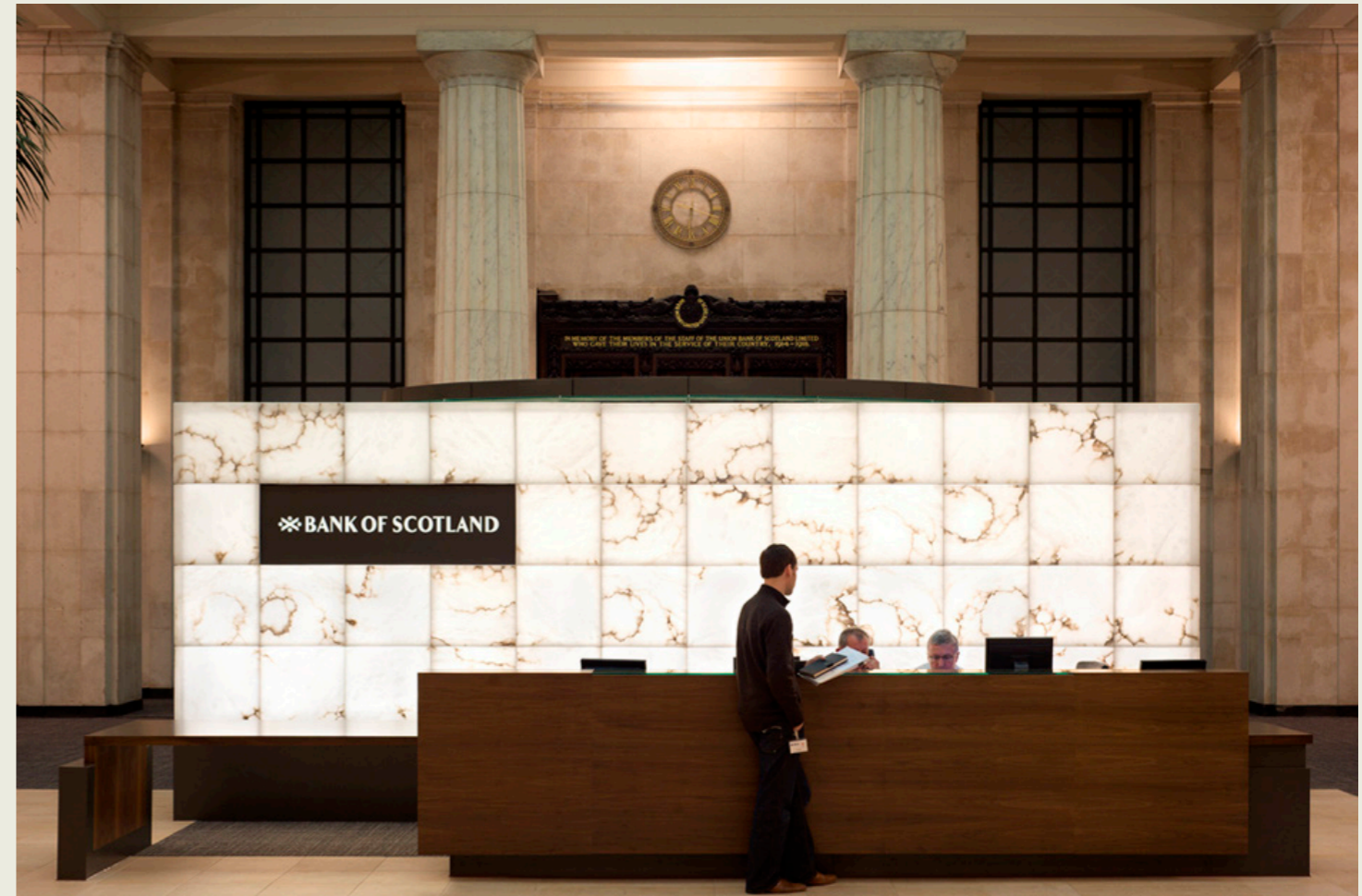
Bank of Scotland