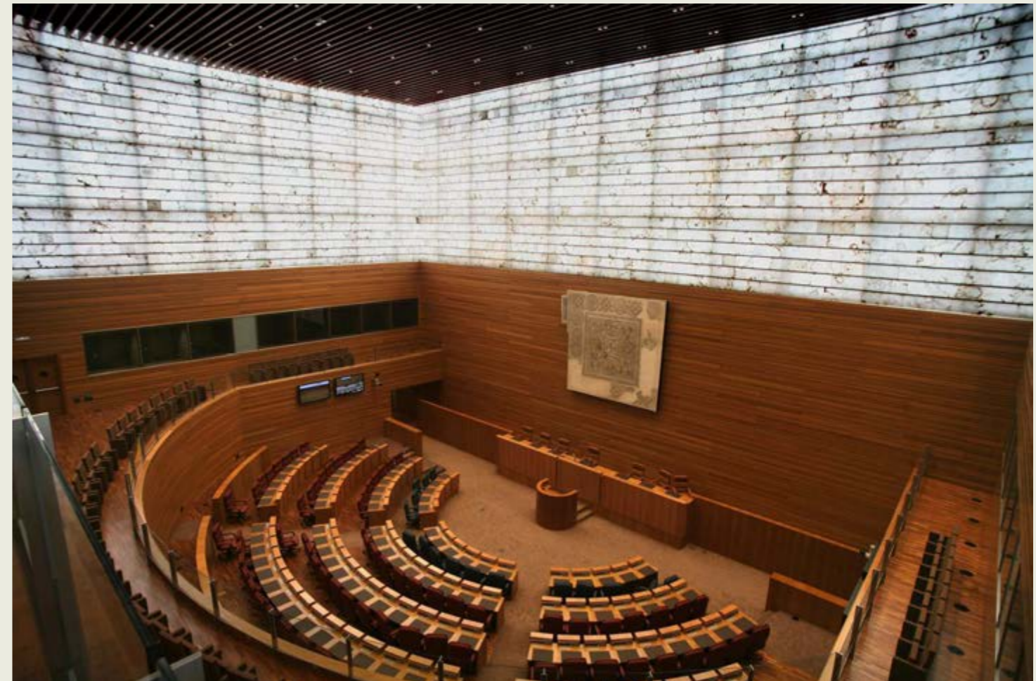
Cortes Castilla y León

Our experience in architecture is measured in built works. We ensure that each alabaster panel is integrated with quality and precision. For unique projects with their own light.