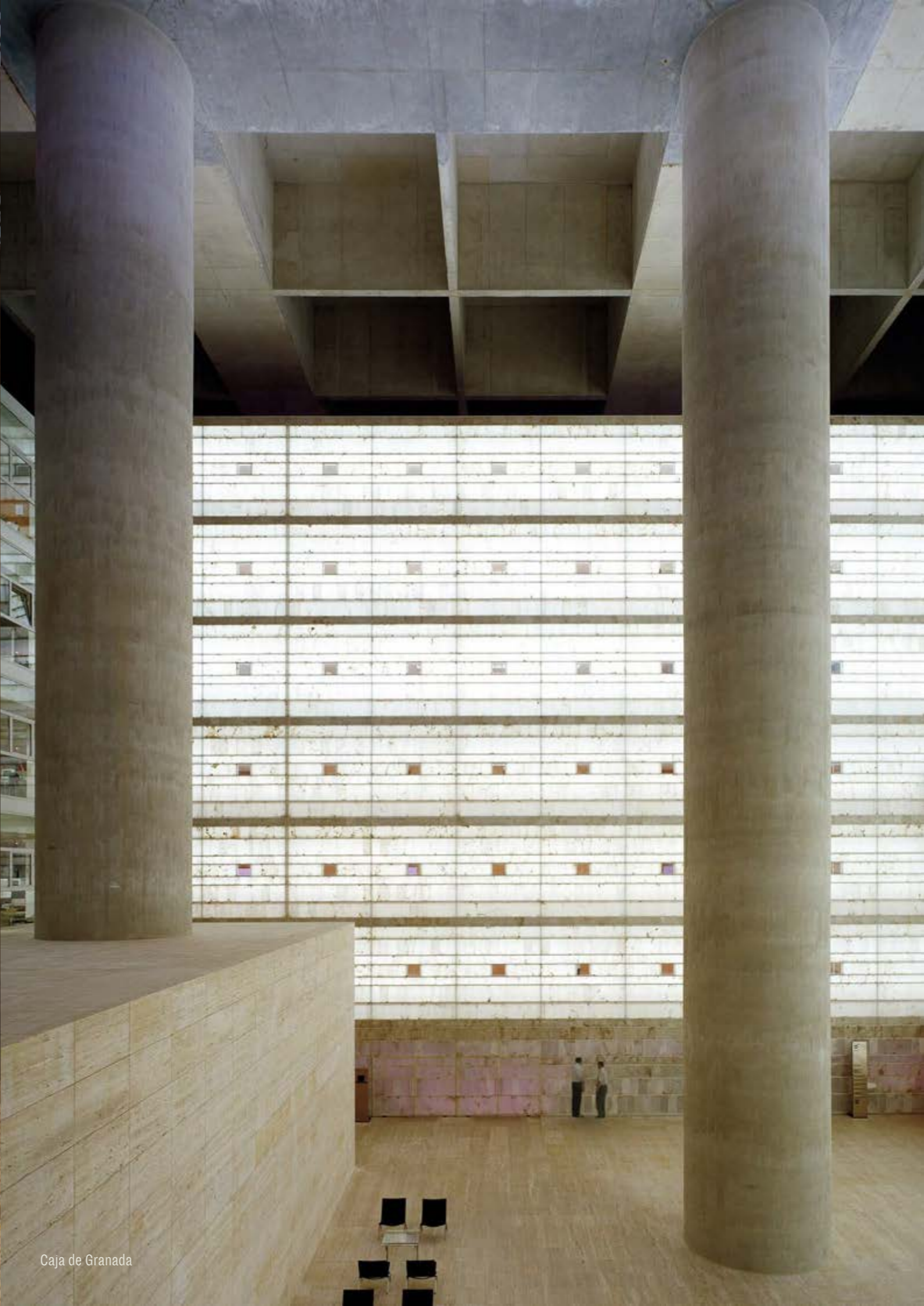
Caja de Granada