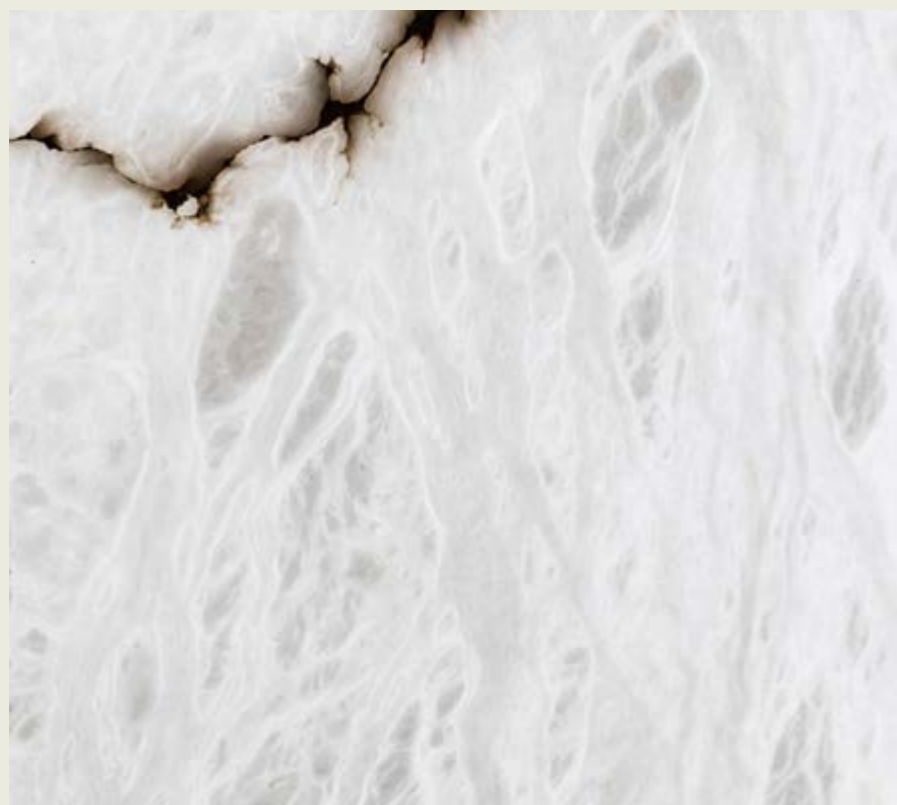
EBRO Recognized for its milky translucency and veining in earthy and grayish tones.

We select the appropriate veining for each project.